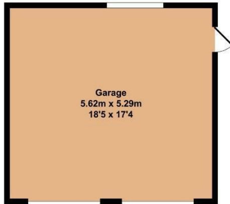
Garage Approx. Floor Area 29.72 Sq.M. (320 Sq.Ft.)

Whilst every attempt has been made to ensure the accuracy of the floor plan contained here, measurements of doors, windows, rooms and any other items are approximate and no responsibility is taken for any error, omission, or mis-statement. This plan is for illustrative purposes only and should be used as such by any prospective purchaser. The services systems and appliance shown have not been tested and no guarantee as to their operability or efficiency can be given.